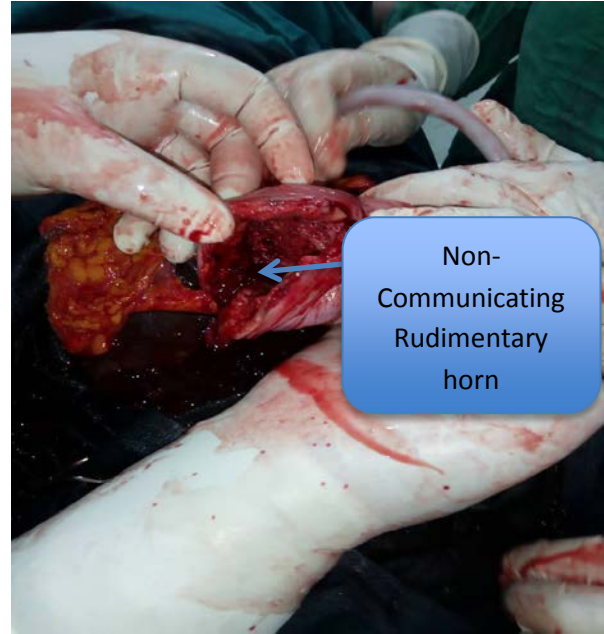
Fig 1: Ruptured Rudimentary Horn

duplication of the renal pelvis and a medullary sponge kidney, an intravenous urogram (IVU) was requested, but this could not be done at that time due to financial challenges on the part of the patient. She was to be reviewed a week later at the outpatients' department with the IVU report, but was lost to follow-up.