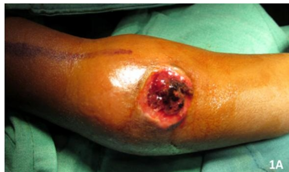
Figure 1: Pseudoaneurysm causing swelling of the left forearm

There was a 5X4cm swelling on the antero-medial aspect of the proximal left forearm with a 1X1cm ulcer at the apex, which contained a thrombus (Fig 1). The swelling was tender, warm to touch but non-pulsatile. Radial and ulnar pulses were palpable.