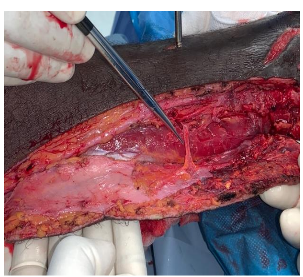
Figure 3: Flap raised with perforator skeletonized