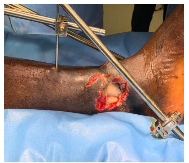
Figure 1: Open tibial fracture distal third of leg