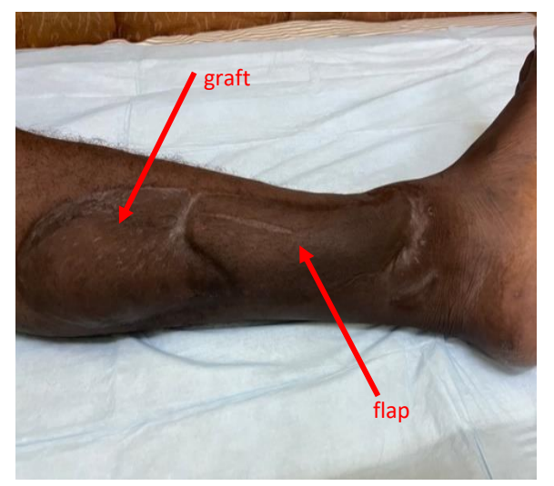
Figure 5: 2-years post operative with flap and Graft consolidated