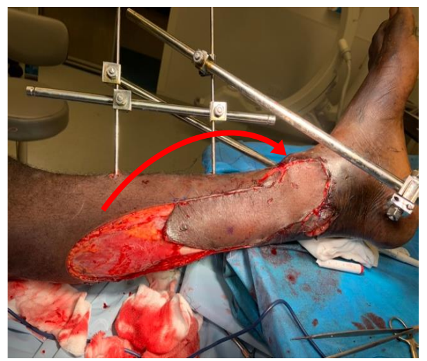
Figure 4: Flap inset after 180^{\circ} rotation, shown with arrow