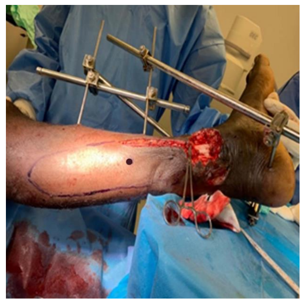
Figure 2: Flap marked out with pivot point (dotted)